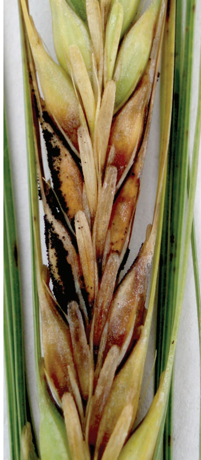
Fusarium head blight on barley.

Oregon State's breeding program is focused on developing facultative