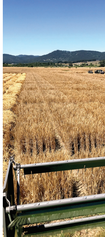
A seed increase of Top Shelf at the OSU Hyslop Farm near Corvallis, OR.